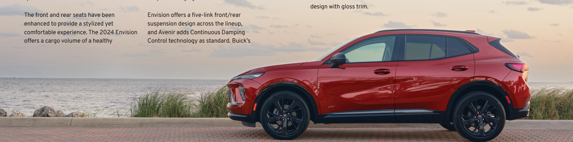
2024 Buick Envision Sport Touring

The Avenir model features chrome accents, Pearl Nickel finish on its alloy wheels, and premium touches such as a massaging driver's seat, multicolor ambient interior lighting and dual-zone automatic climate control. ■