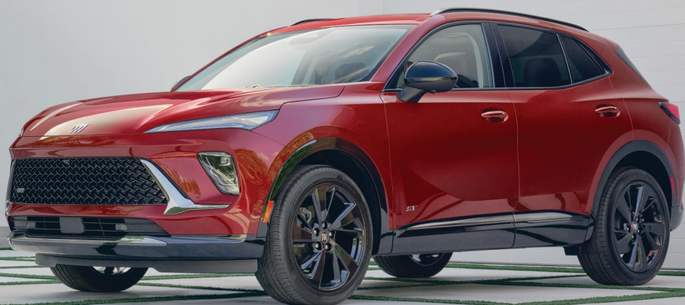
2024 Buick Envision Sport Touring

Service Repair News From Your Parts Supplier