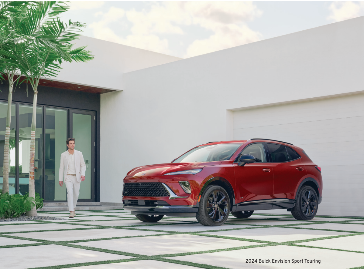
2024 Buick Envision Sport Touring